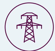
INDEPENDENT SYSTEM OPERATORS