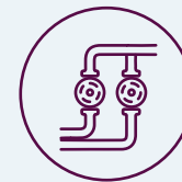
COMMODITY PROCESSING AGREEMENTS